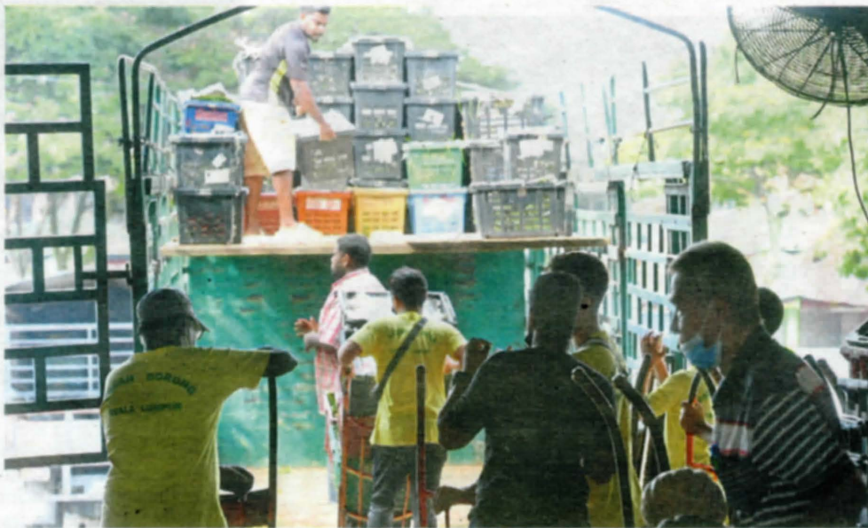
Workers taking turns to unload fresh vegetables and fruits from a lorry at Pasar Borong Kuala Lumpur.