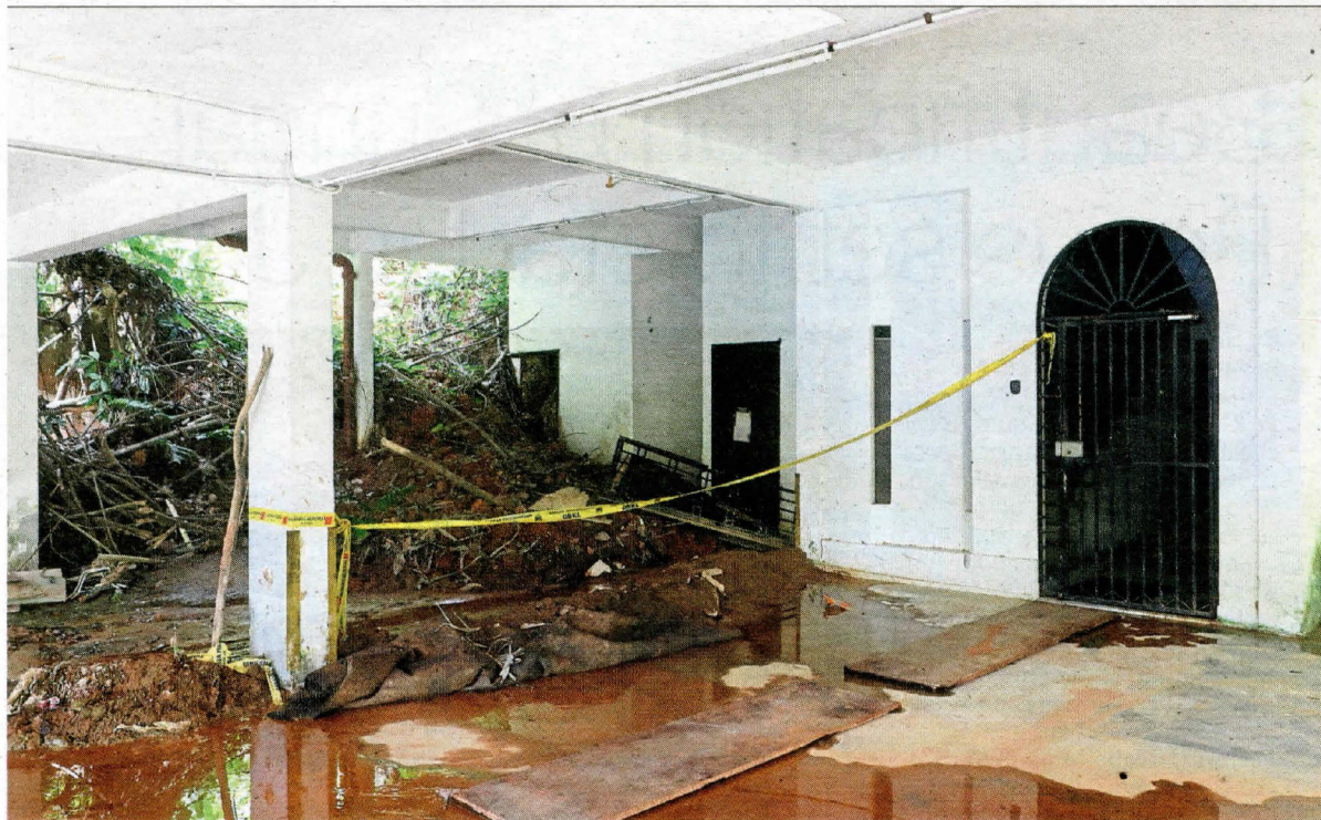
The landslide in November last year resulted in mud entering the living room of a lower-floor apartment in Persiaran Syed Putra, Kuala Lumpur.