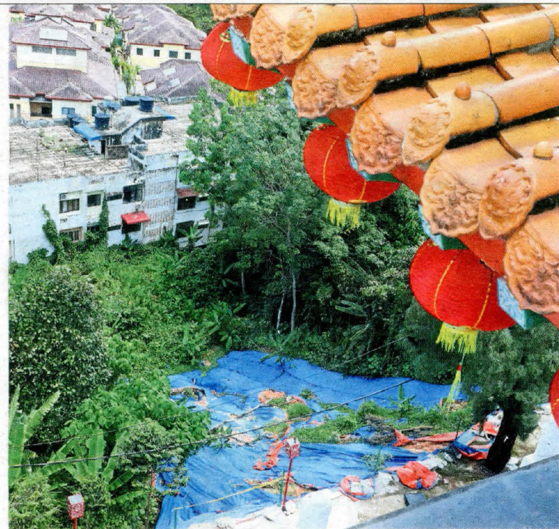
The landslide, covered in tarpaulin sheets, occurred on the left side of Thean Hou Temple.