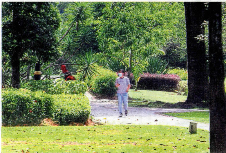
More greenery is in store for Kuala Lumpur folk.

"Kuala Lumpur is an old city with its own existing problems but it remains an important commercial centre as the country's capital."