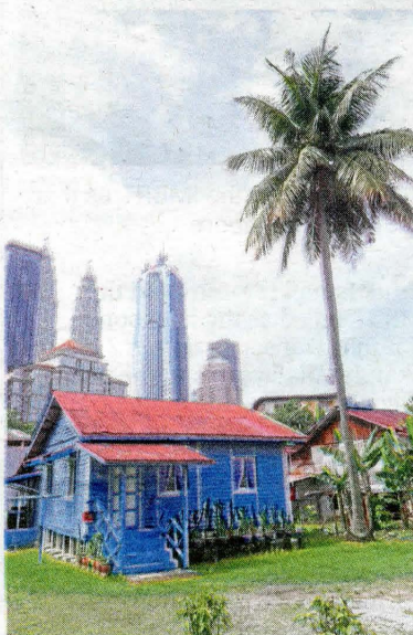
The redevelopment of Kampung Baru in Kuala Lumpur is moving forward.