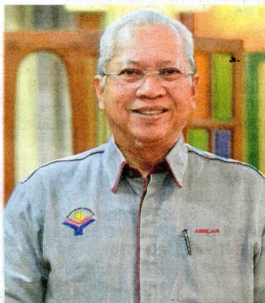
Annuar: We are looking at developing RoL from Brickfields to the Selangor boundary.