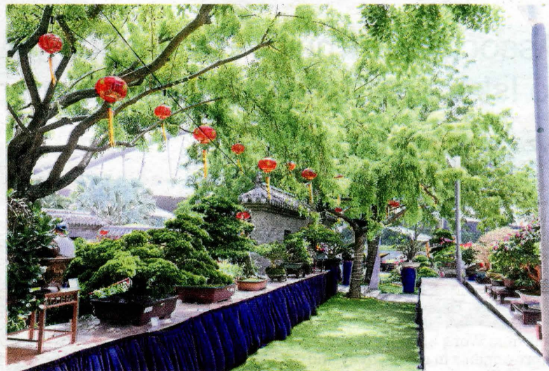
Putrajaya's Precinct 4, which has hosted the Floria festival, will have more facilities for family outings.