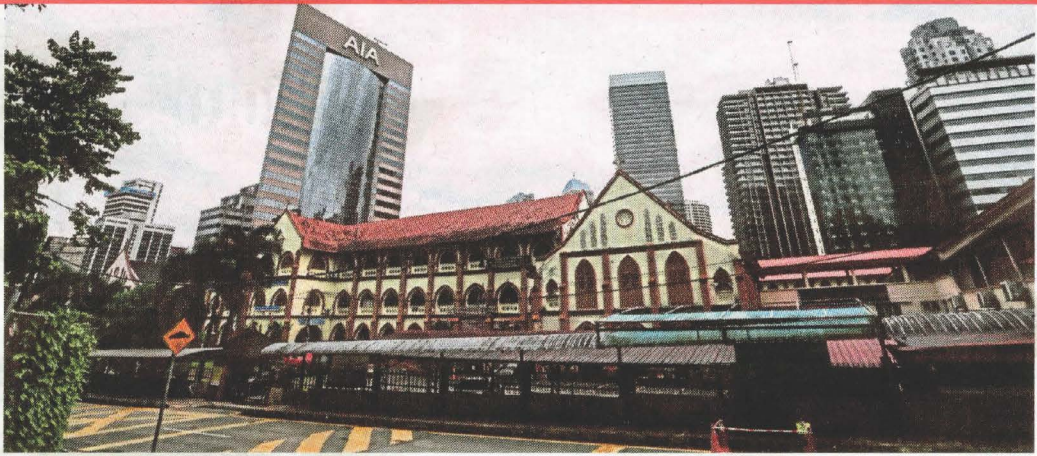
Once SMK Convent Bukit Nanas's lease expires, the land will be returned to the government. FILE PIX

However, it said that the land would be returned to the government once its lease expires so that the facility could be gazetted as a fully-aided government school.