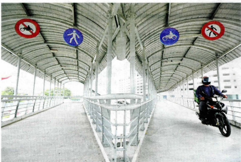
The overhead bridge is meant for both pedestrians and motorcyclists but access to the pedestrian side was closed by the landowner last month.

Attempts to get Sulaiman's response on the matter has been unsuccessful.