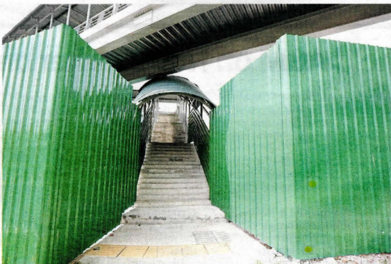
The walkway on the main road was closed to pedestrians due to construction of a residential project next door.