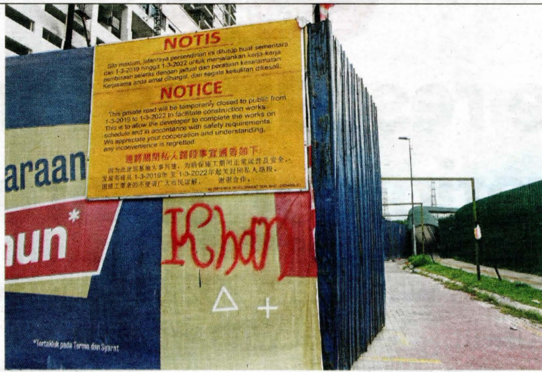
A signboard put up by the developer informs residents of the road closure until next year.