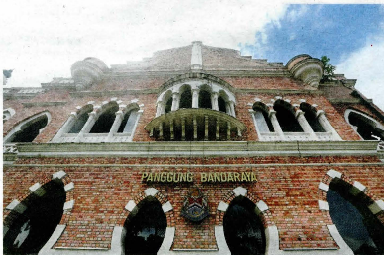
Panggung Bandaraya, a heritage buildings in KL, will come to life during KLWKND with theatre and literary events.