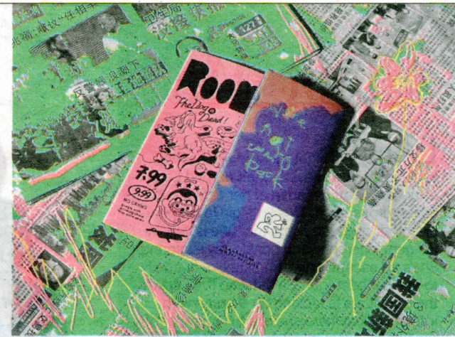
A close-up view of design outfit shuuhuahua's We Are Not Coming Back zine.