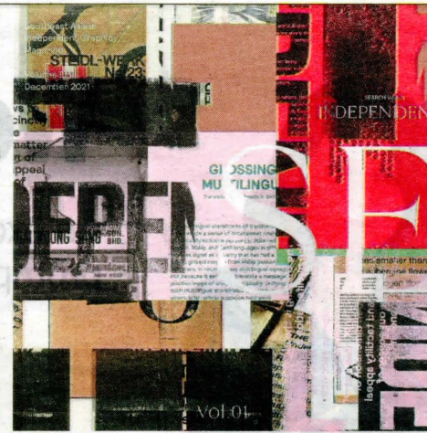
KLABF will also see the launch of Search Vol. 1 , a new addition to the South-East Asian graphic magazine scene.