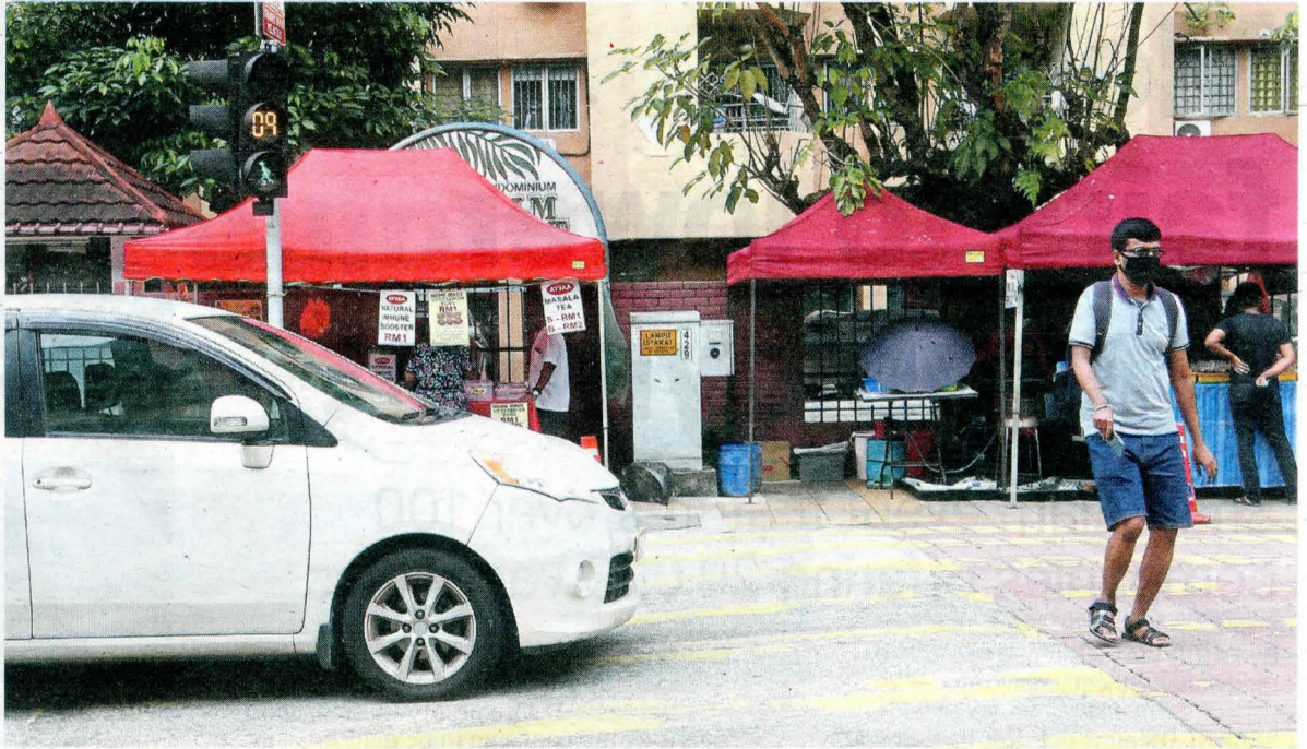
Traffic rules fall by the wayside in Jalan Sultan Abdul Samad in KL as vehicles cross the line at signalised traffic lights. The presence of roadside hawkers on pedestrian walkways in the background worsens the situation.