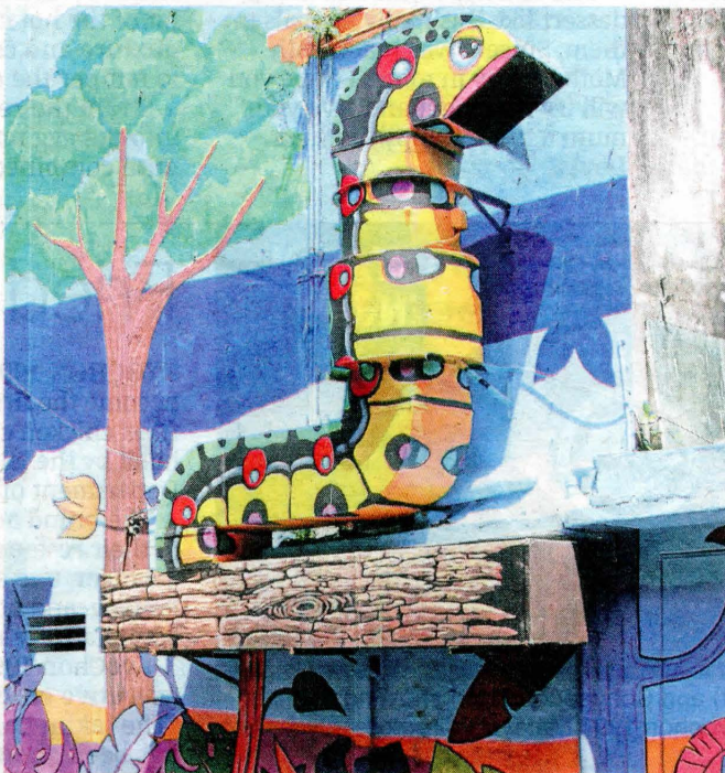
(Left) DBKL's creative team incorporated this restaurant's exhaust fan and turned it into a giant caterpillar as part of a mural in the back lane of Lorong Alor in Bukit Bintang.