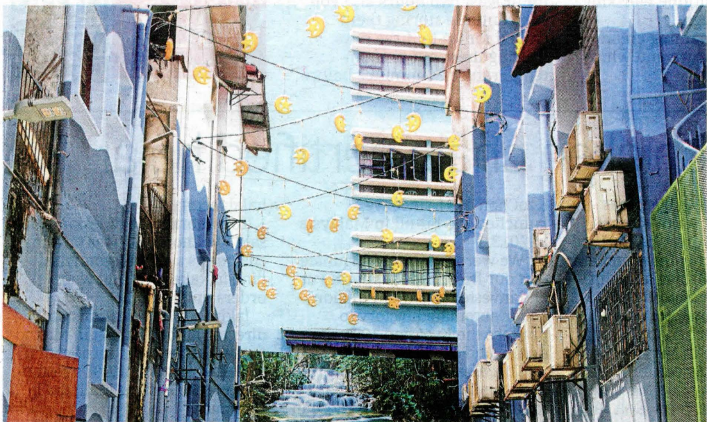
The facade of shophouses and residences in Bukit Bintang now sport a more colourful look.