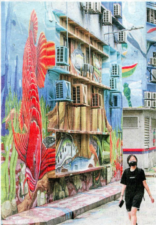
A woman walks past an eye-catching mural with aquatic elements.

The project is ongoing as more back lanes are still being painted, including at Jalan Alor, Jalan Berangan, Jalan Changkat and Jalan Rembia in Kuala Lumpur's Golden Triangle.