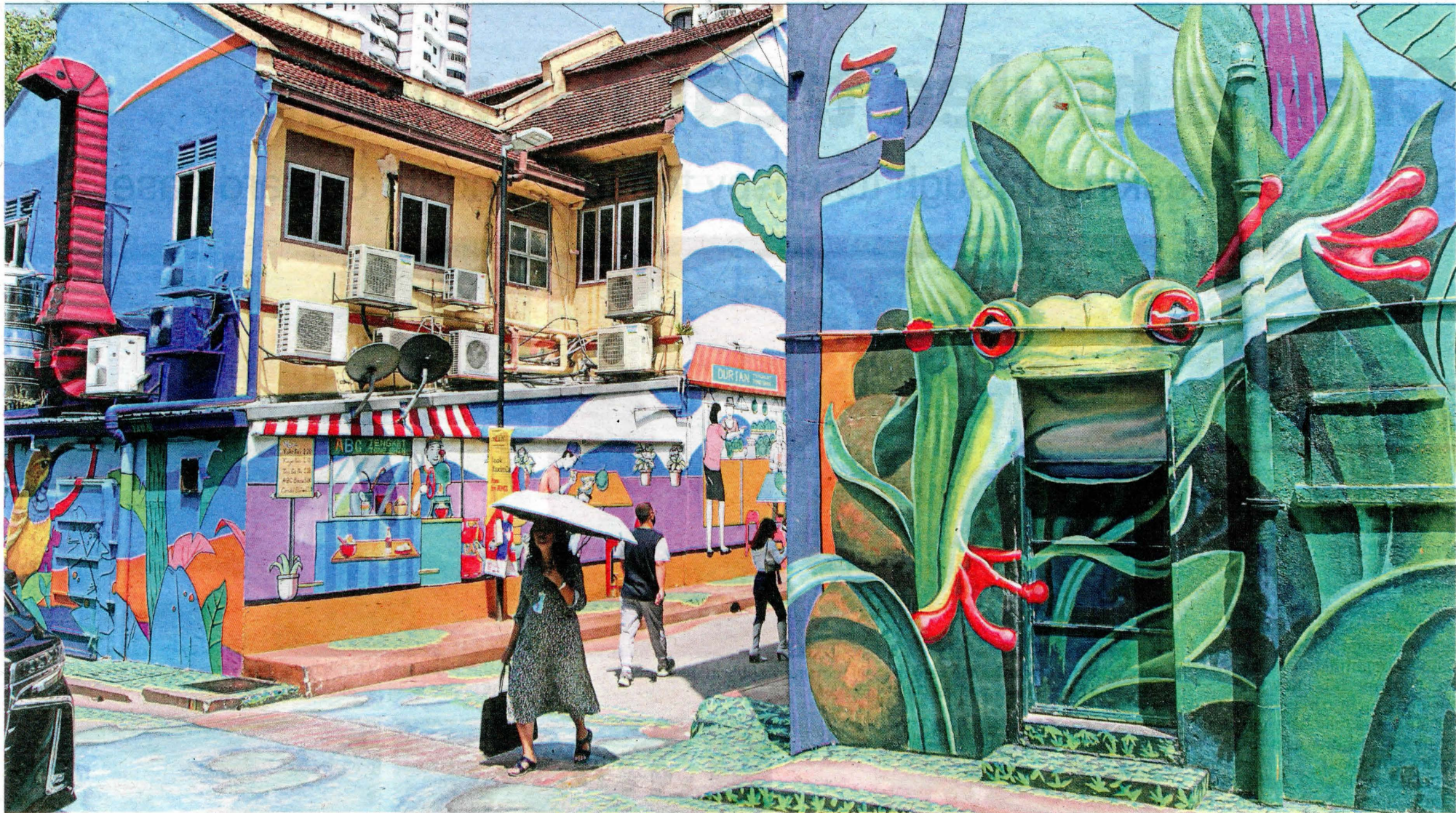
A frog peers out from a vibrant mural in Bukit Bintang, transforming what was once a seedy part of the city into a garden of sorts..