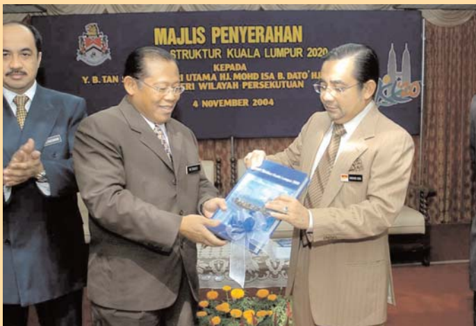
Brig. Gen. Datuk Mohamad Shaid bin Mohd. Taufek, the outgoing Mayor of Kuala Lumpur officially handing over the KLSP2020 Report to the Federal Territories Minister, Tan Sri Hj. Mohd. Isa bin Dato' Hj. Abdul Samad. Behind the Mayor is Datuk Hj. Zulhasnan bin Rafique, Deputy Minister of Federal Territories.

The Kuala Lumpur Structure Plan 2020 can be examined and purchased during office hours at the Master Plan Department, 12th Floor, City Hall Building, Jalan Raja Laut from 4th November 2004. The Bahasa Malaysia version can be obtained at RM120 per copy and the English version at RM150 per copy.