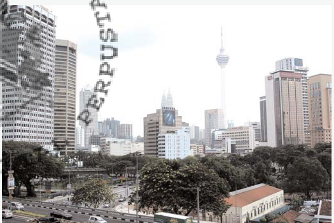
Kuala Lumpur in 2004, after 30 years. The building on the extreme left is the current City Hall Building along Jalan Raja Laut. In the distance at the centre is the famous tallest 88 storey Petronas Twin Towers.