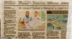
StarMetro's March 22 report about the flyover project. (Left) Workers adding the finishing touches to the new highway from Jalan Maarof.