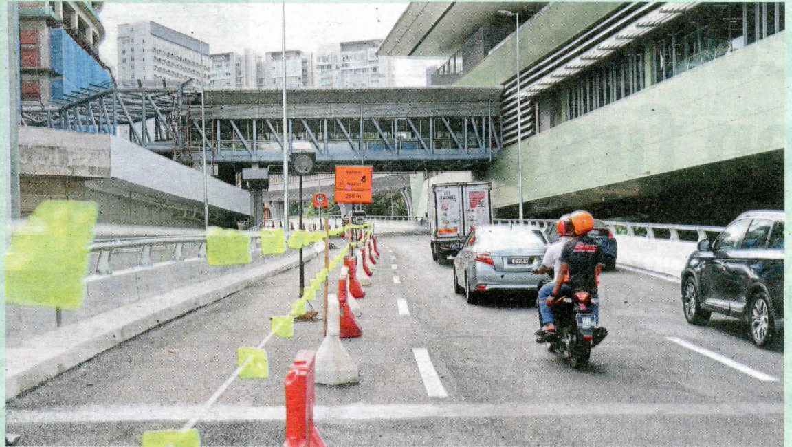
The flyover from Jalan Maarof to Jalan Semantan in Bangsar can now be used.