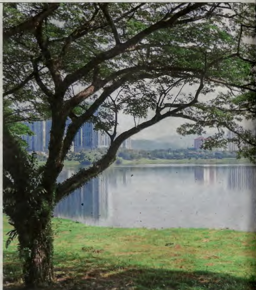
Experts say a 50m buffer around a retention pond is crucial for monitoring purposes and future expansion.

on both days,” said the land office in a statement to StarMetro .