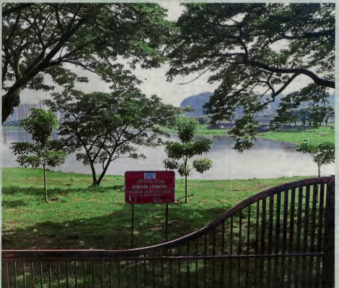
PTGWP says a notice about the degazettement of Batu retention pond was put up at the site, but Lim says the area is not accessible due to perimeter fencing.

The proposal was earlier approved despite objections from various government agencies which had said that alienating land surrounding flood retention ponds for development was a recipe for disaster.