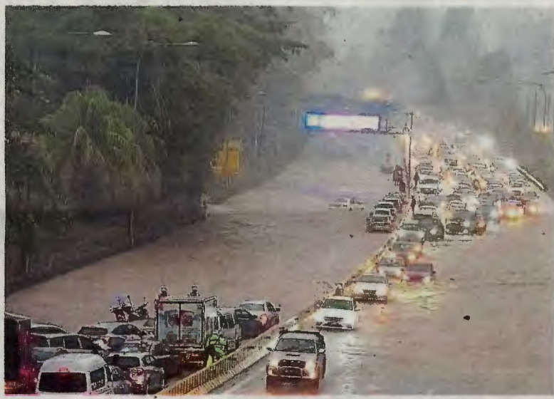
Jalan Kuching flooded after a downpour on April 25, 2022, taken from ITIS DBKL's Facebook page.