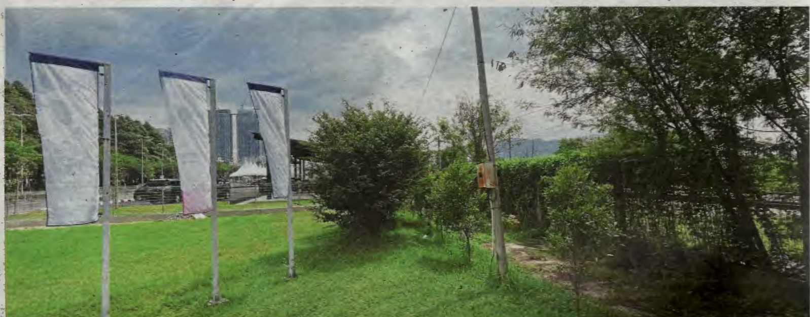
A view of the land opposite Laman Hijau along Jalan Kuching and Jalan Sultan Azlan Shah that's occupied by the showroom.