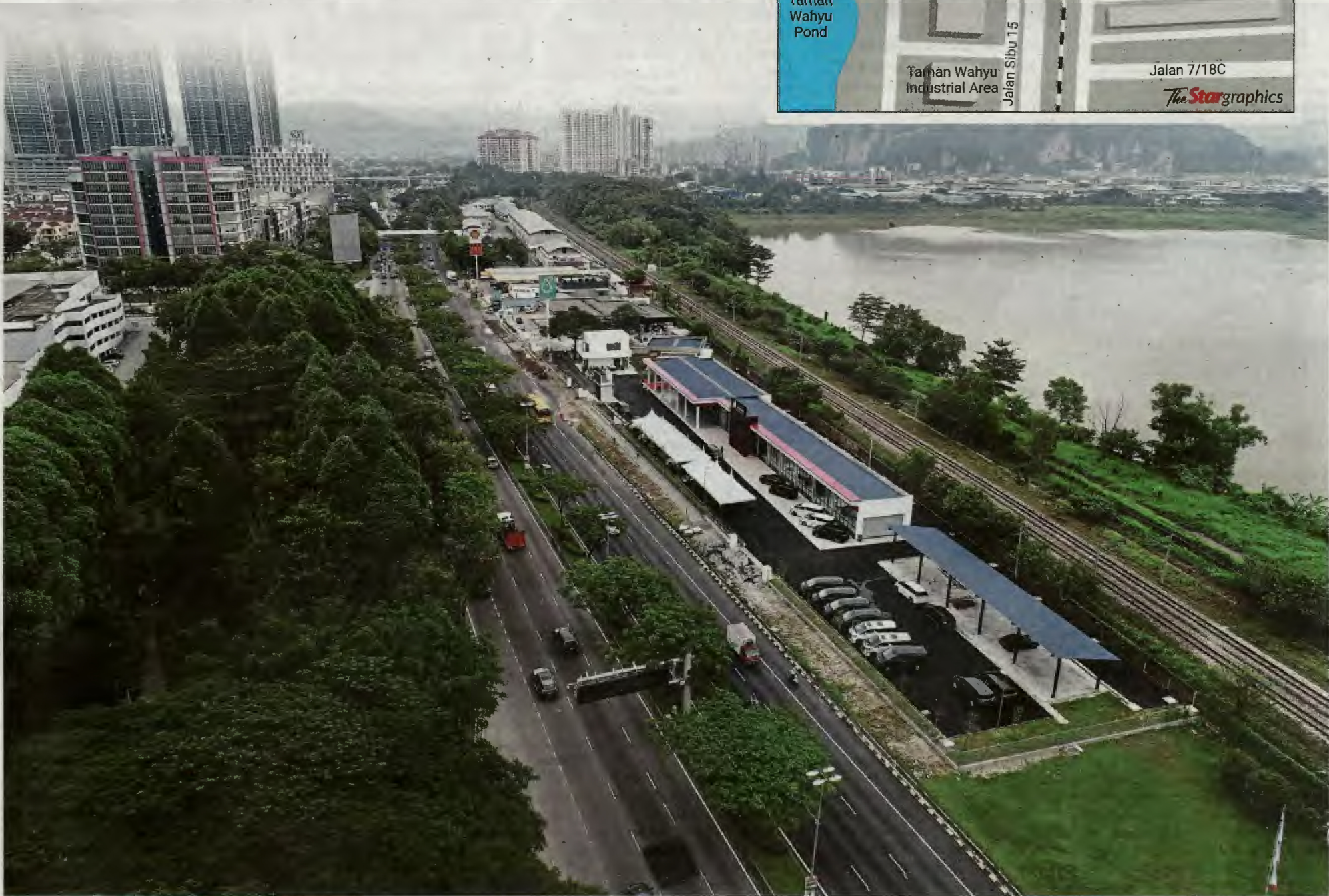
Prime spot: The former green lung space (right) opposite Taman Metropolitan Batu in Jalan Kuching, Kuala Lumpur, is now leased to a car showroom.