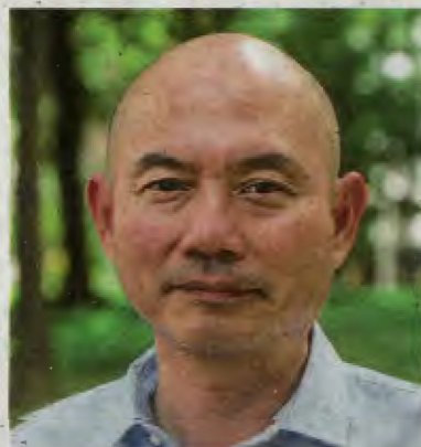
Lim says it's odd to gazette the land, only to lease it out to a third party a few years later.