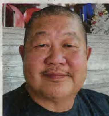
Puah says the area is not suitable for a car showroom, or any structure.

Under the lease agreement, dealer pays RM24,449 annual premium to land office for site located at Jalan Kuching