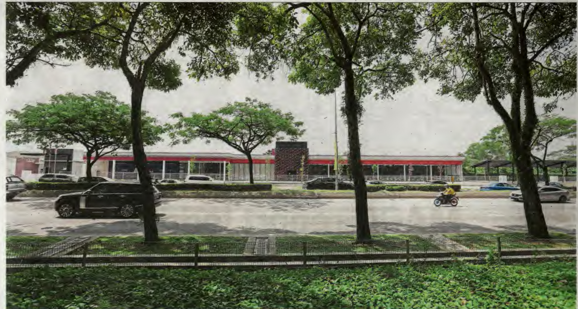
In 2020, an application for the land to be leased to a company was approved with an annual premium of RM24,449.

any engagement or objection hearing required since the lot was a gazetted green lung, the land office said: "Each application (to lease) land must get state government approval and does not require (solicitation of) public objection.