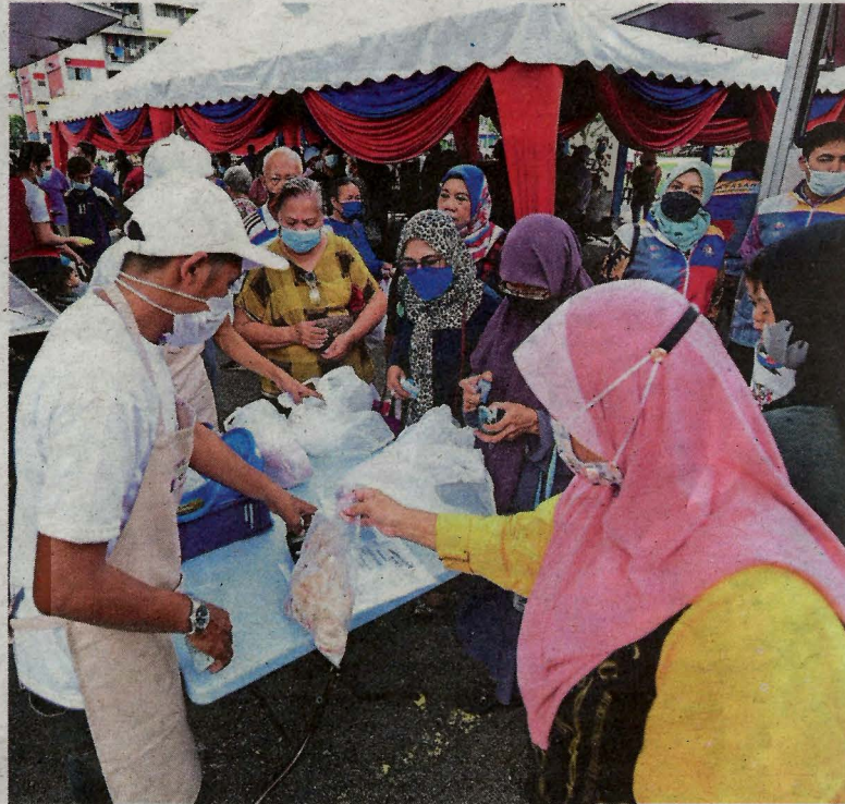
Under the MYGrocer@Wilayah programme, food items like chicken, oil and eggs are sold at a subsidised rate.