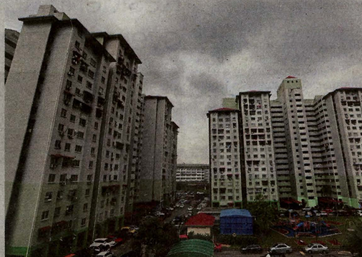
More than 60,000 public housing units have been built or are in various stages of completion throughout the Federal Territories.