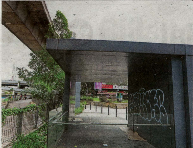
There have been numerous complaints about the lack of maintenance of facilities and infrastructure, such as this vandalised structure along the River of Life near Central Market in Kuala Lumpur, which the minister says must be addressed.

Every leader has their own method. I intend to adopt a different approach, but that said, I will not disregard the suggestions made by the former minister.