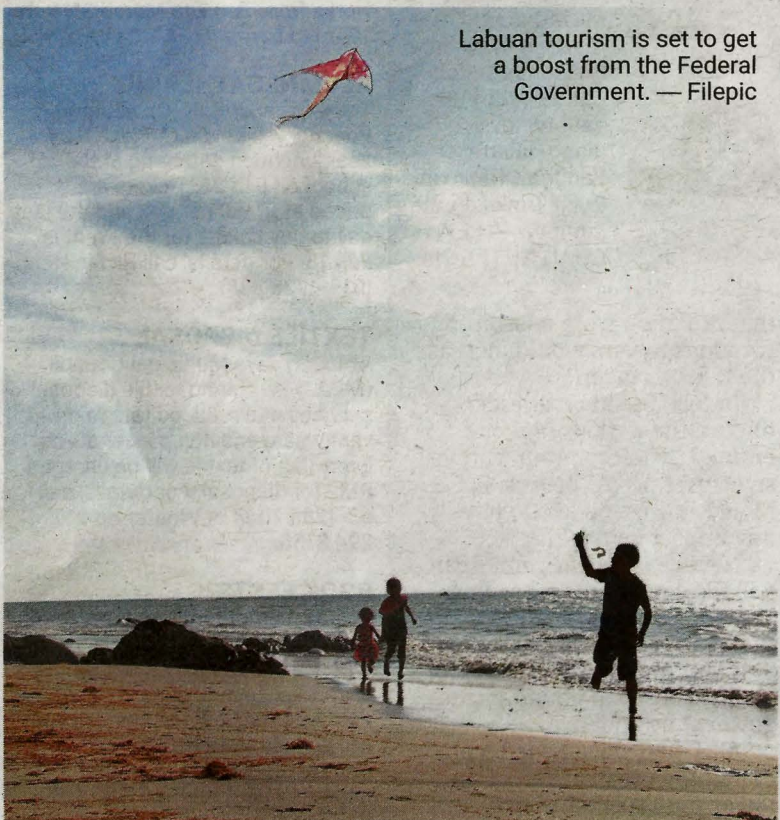
Labuan tourism is set to get a boost from the Federal Government.

I aim to resolve these issues by next year. The government has allocated RM300mil to address these problems. If both of these issues can be resolved promptly, we can then focus on enhancing the economic and tourism aspects of Labuan.