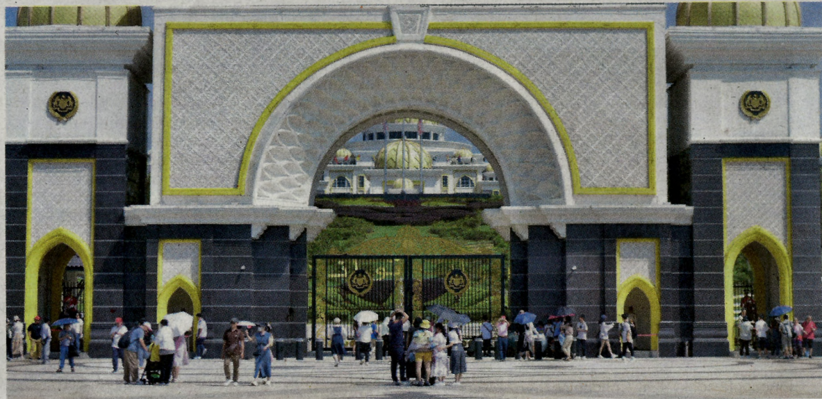
Visitors admiring the outstanding architecture of Istana Negara.