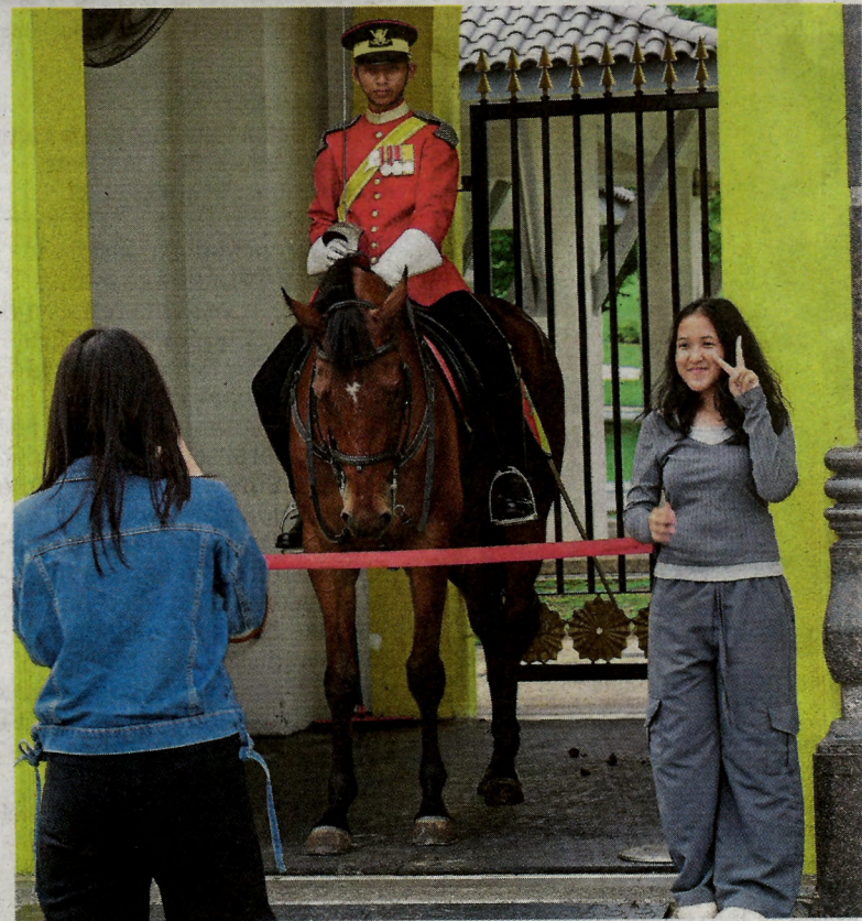
A tourist posing next to a guard on horseback at the entrance.