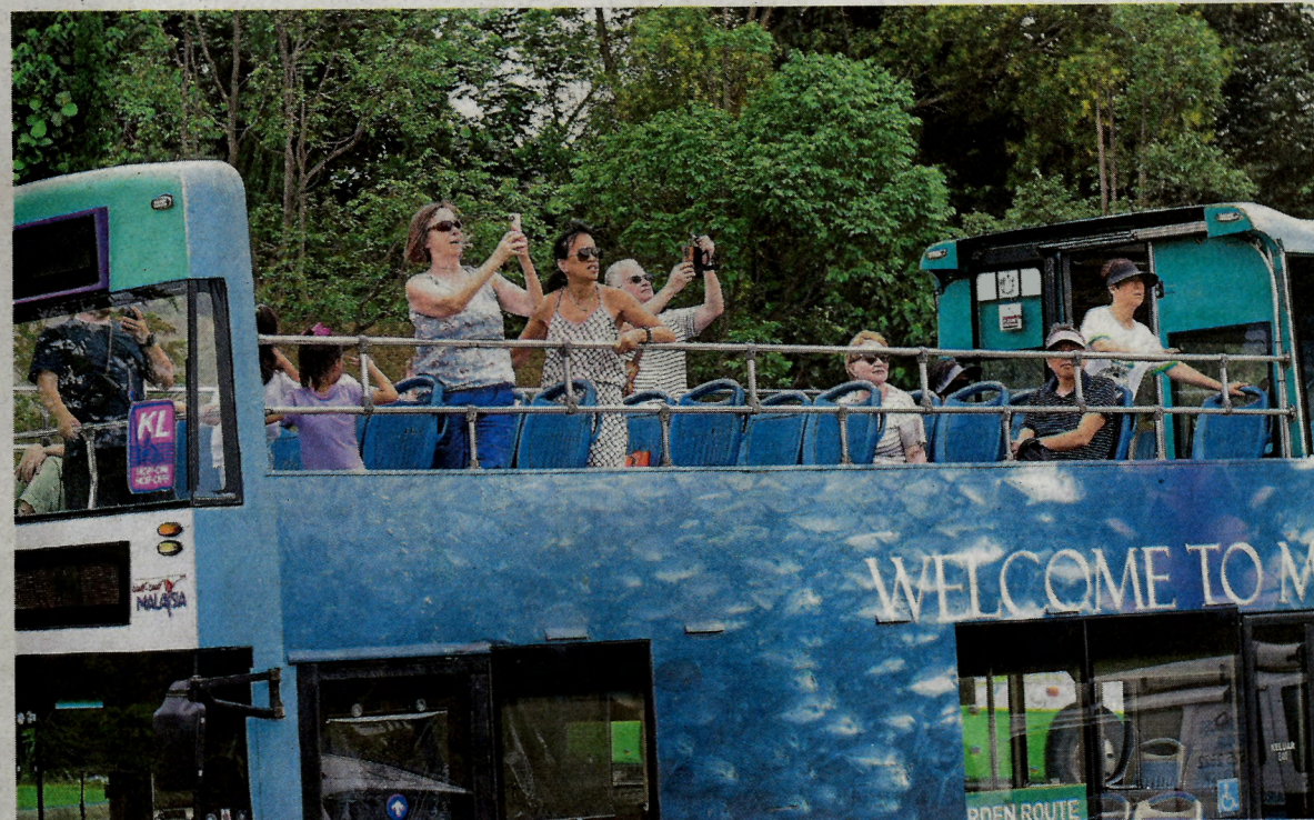
Tourists snapping photographs of Istana Negara from the KL Hop-On Hop-Off bus while (right) another group poses in front of the palace.