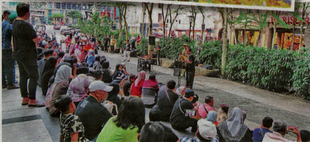
People sitting on the steps outside Sogo to watch buskers perform.