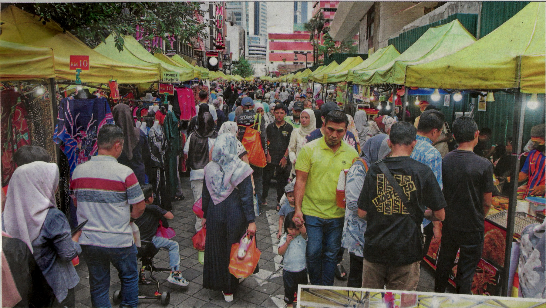
Lorong Tuanku Abdul Rahman in the heart of Kuala Lumpur is closed from 5pm until late on Saturdays for the night market.