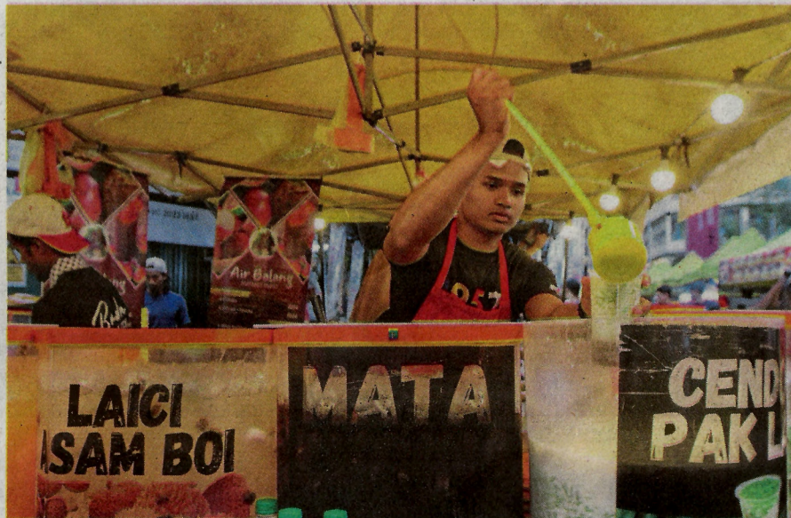
Grilled corn (left) and drinks (above) are among the delicious fare along Lorong Tuanku Abdul Rahman when Saturday evenings roll around.