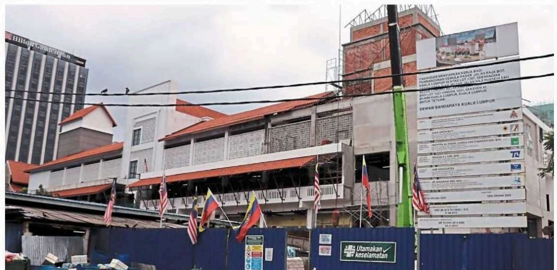
The new Pasar Raja Bot that is located next to the old one will be completed soon.

DBKL cited the example of how a trader selling fish would be charged RM480 annually under the 1984 by-laws whereas under the 2016 by-laws, the rate would be RM780, a RM300