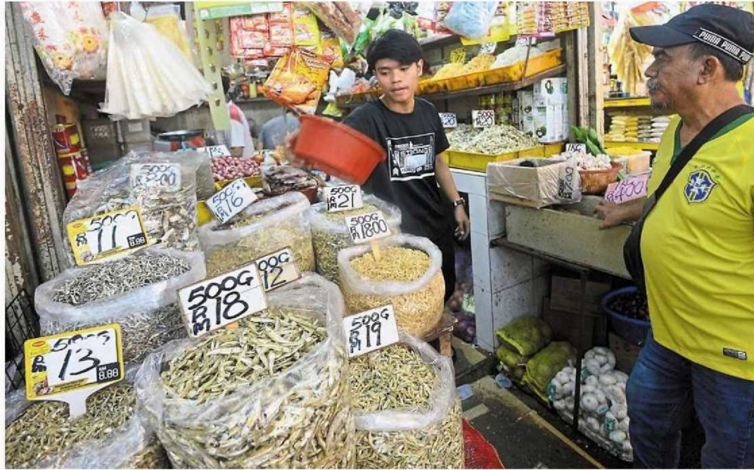
A total 1,477 stall owners at the existing market are supposed to relocate to the new building.

Traders ask DBKL to reduce stall rental at new building by 70%