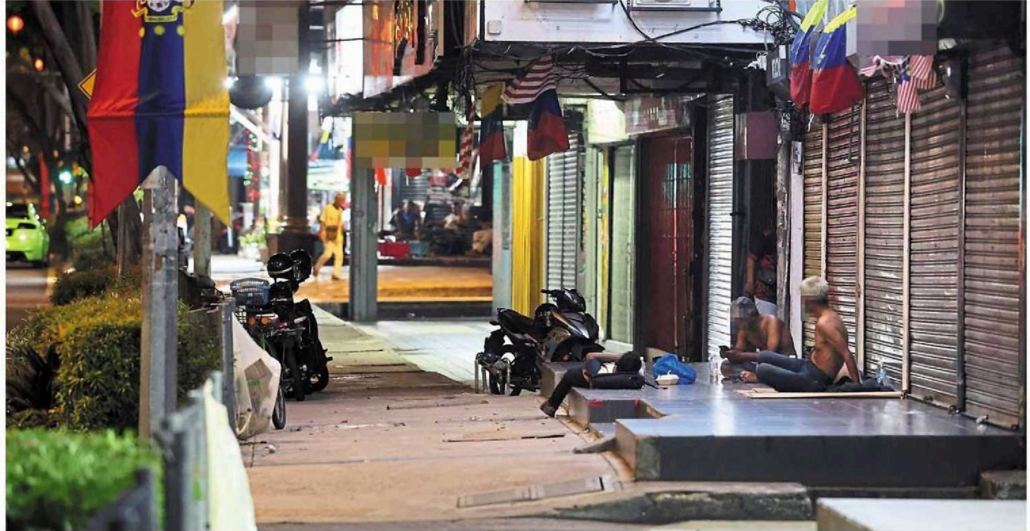
People pictured sitting or lying down at the five-foot-way along Jalan Raja Laut in Chow Kit, Kuala Lumpur.

Vagrants, homeless marring city's image among visitors to these areas