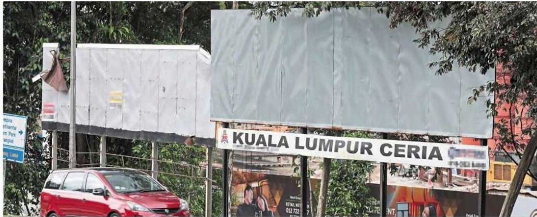
Residents want old billboards in the city removed as they pose a danger. Similar billboards are seen here in Jalah Megah Mendung, off Jalan Kelang Lama.

years, irrespective of whether the advertised event was over, as long as the permit was paid.