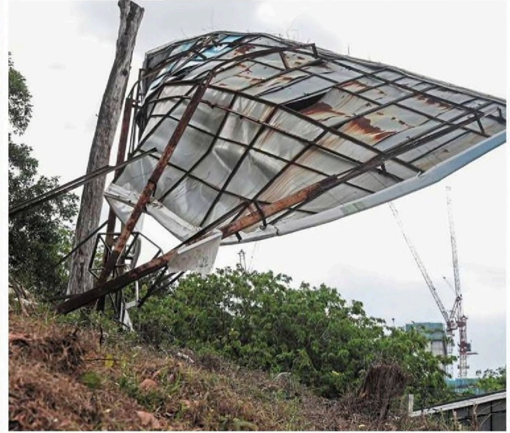
The collapsed billboard at Jalan Gembira has yet to be removed.