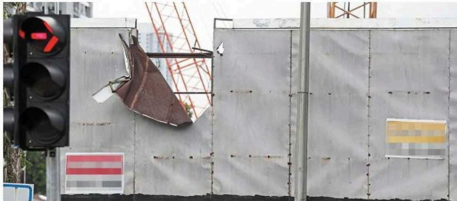
A damaged billboard on Jalan Mega Mendung off Jalan Kelang Lama.

He suggested that these include location restrictions and limits on