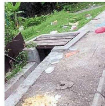
DBKL faces a big challenge regarding people who feed stray dogs.

no dogs or pets, then we go with the management.