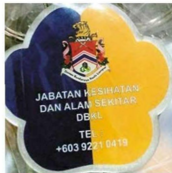
New DBKL dog licence has the information of the pet and its owner.