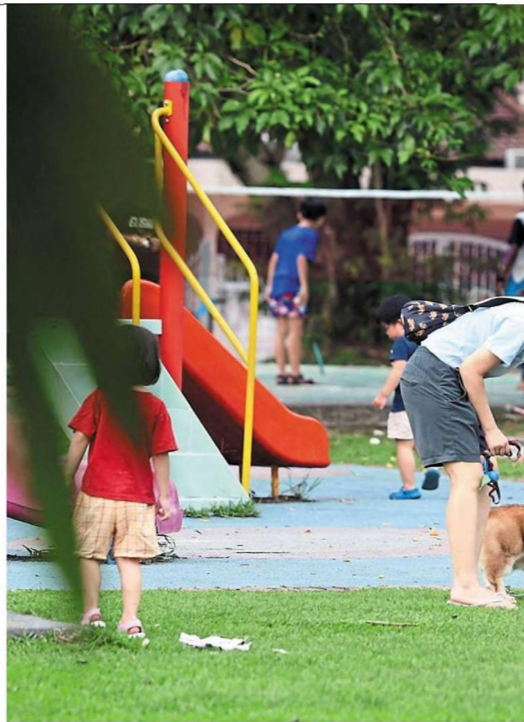
DBKL warns dog owners that any dogs caught without their owners will be confiscated.