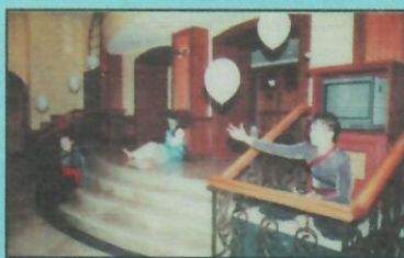
Such performance to be held at Panggung Bandaraya.

A meeting will soon be called comprising of all theatre production companies in Kuala Lumpur to discuss ways and means to fully utilize the theatre (panggung) and make it the happening place for theatre.