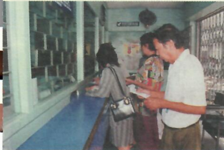
Public settle their assessment bills.

Those who have problems in settling their assessment can come and discuss with respective City Hall Assessment Officers.