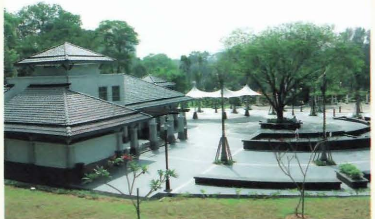
The newly renovated lower level of the National Monument on the left is the administrative block and the newly renovated toilets. On the right is the 100 year-old Bunga Tanjung tree.

The monument built by Mr. Felix de Weldon was complet-