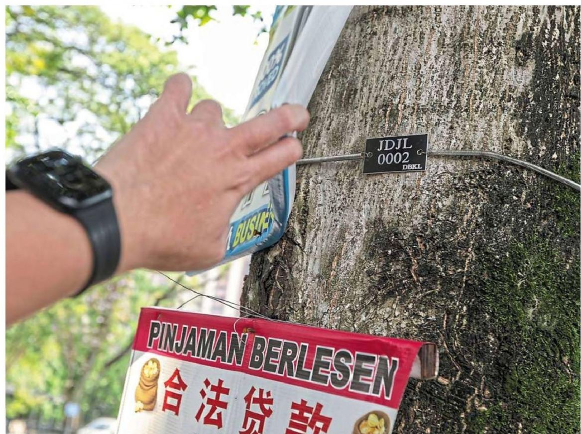
DBKL tree tag covered by an illegal banner.

"The tree labels or tags are important because without them, it will be difficult for