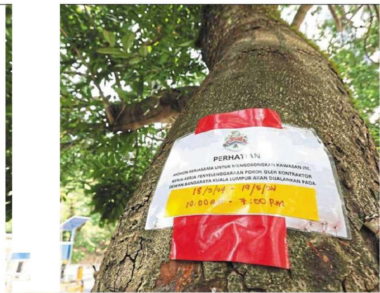
Notice on a tree that has been identified for felling in Taman Desa.

yellow tag with serial numbers. When contacted, a DBKL spokesperson said trees tagged with a yellow label had been assessed by an arborist, while black-labelled ones had been inventoried. "Tagging the trees is important as it ensures proper management," said the spokesperson, adding that a team would be sent to check on the illegal banners. According to the Federal Territories Department, there are 236,651 trees in Kuala Lumpur. Of this number, 1,346 trees are more than 30 years old. On May 7 and May 13, thunderstorms caused dozens of