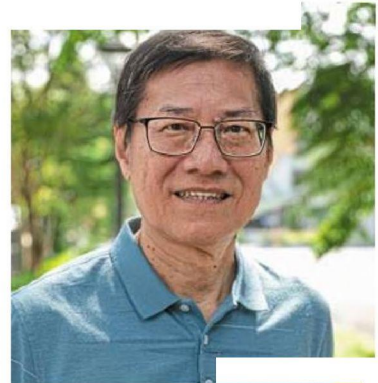
Koh says DBKL contractors tend to prune branches but leave tops of trees untouched.

DBKL to track and monitor the health and condition of the trees.