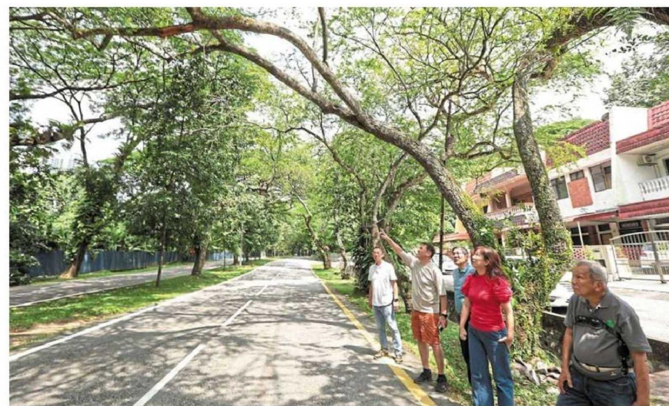
Taman Desa Residents Association members showing trees that require pruning.

trees to fall in the city, causing damage. One person was killed, while two others were injured in the May 7 incident. Following this, DBKL said City Hall-appointed certified arborists had identified 28 trees in the city as high-risk in its latest periodic inspection. DBKL said these trees would be felled soon, following scheduled checks on trees 30 years or older, or those with a circumference exceeding 1.5m, around Kuala Lumpur from 2019. It said 175 trees had been identified as high-risk, with most exceeding 50 years old. Of this number, 147 trees have been felled.