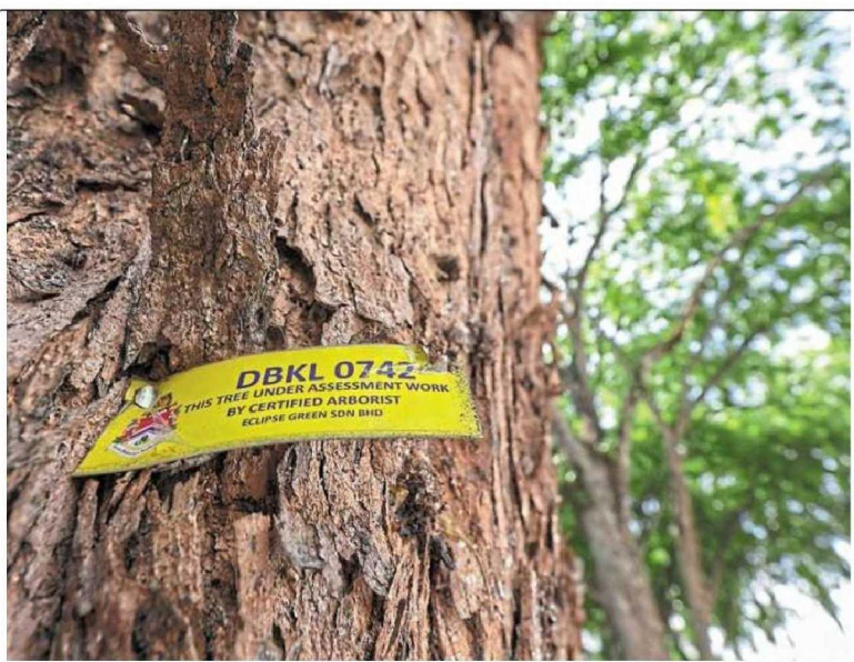
A yellow tag indicates this tree has been checked by an arborist.