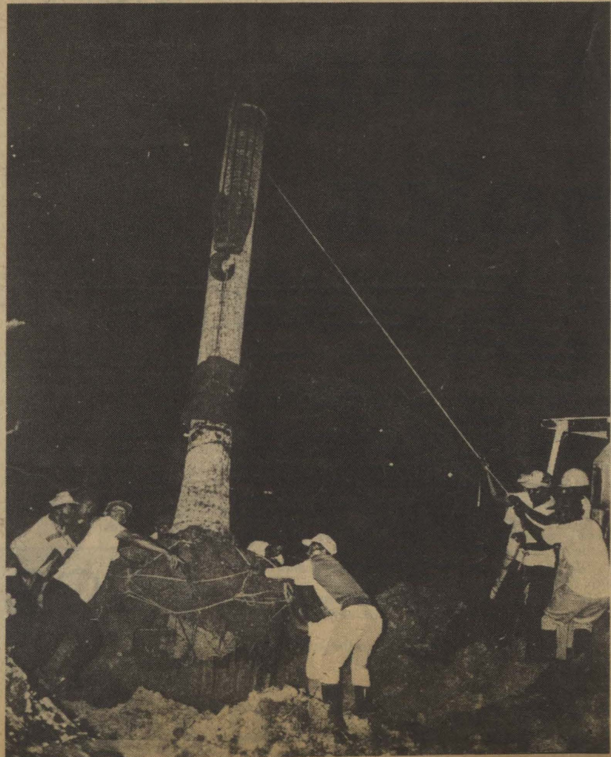
HEAVE HO: City Hall workers transplanting a Royal Palm tree late last night