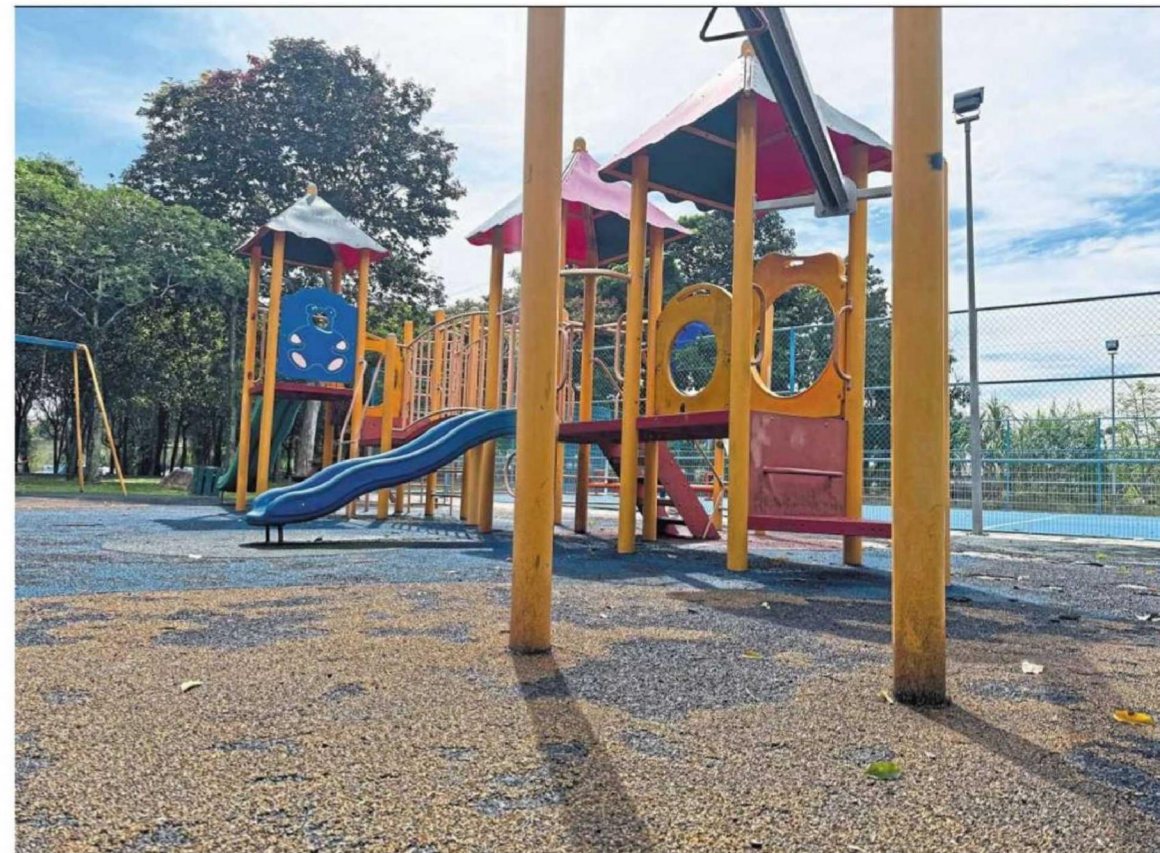
The flooring tiles at Taman Sri Segambut playground are damaged.