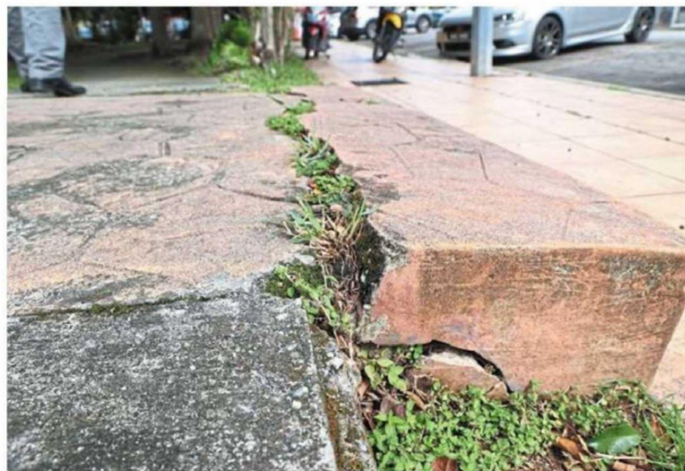
Cracked steps at the playground of Laman Rimbunan Mawar.

Apart from water ponding at various spots, overgrown weeds can be seen jutting out of several cracked walkways.