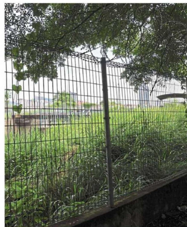
Untrimmed grass near the Suria Homes playground.