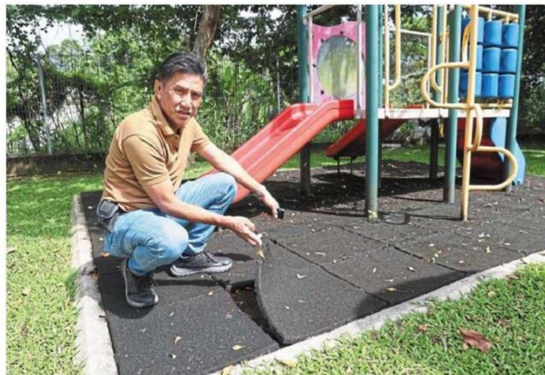
Low says loose and dislodged rubber pavers at the Suria Homes playground pose a safety risk.

dents coming here for leisure and exercise but these days almost no one uses the playground anymore," he said.