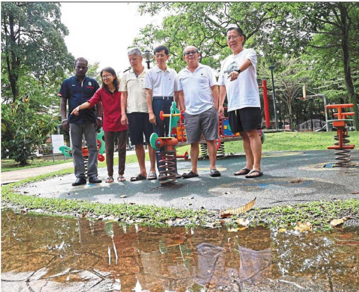
Laman Rimbunan residents say stagnant water at the playground after a downpour could turn into potential breeding ground for mosquitoes.