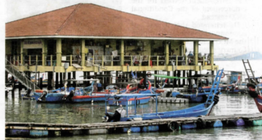
The fishing community is grateful for the attention given to them in the budget.