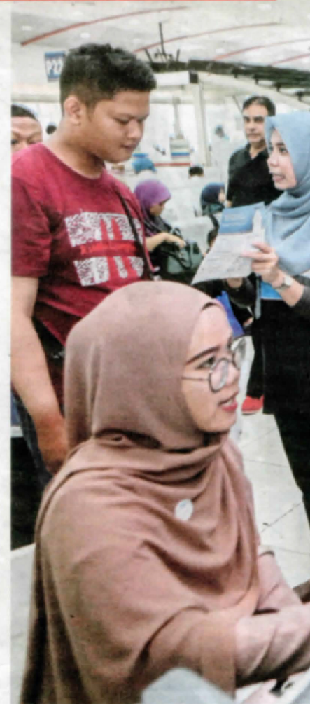
University graduates are confident the budget will help them land jobs and enable upskilling.

"An excellent Internet access can facilitate high-definition video streams for both students and lecturers, which will improve the quality of online distance learning," the University Malaya law student said.