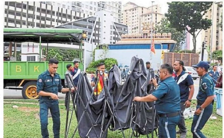
DBKL officers removing the abandoned stalls in Bukit OUG.