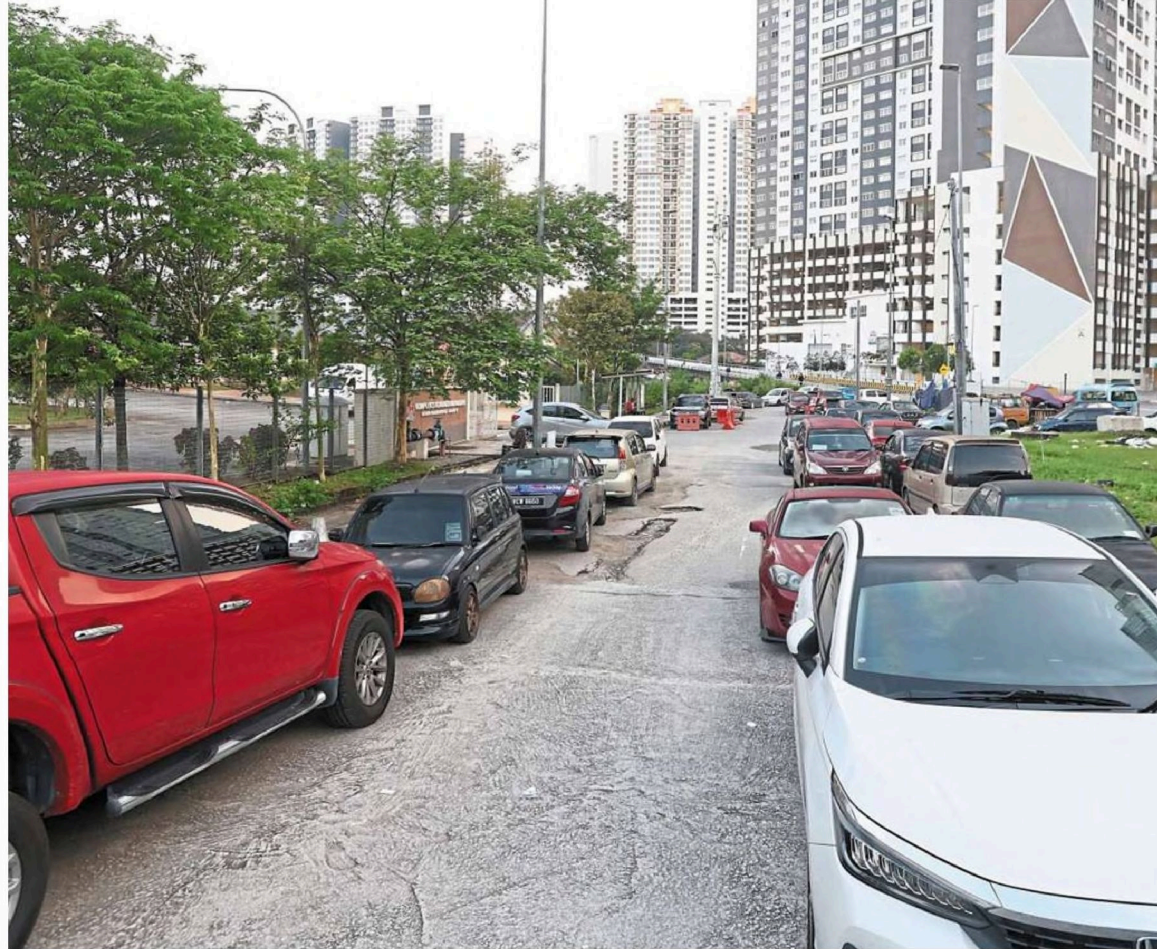
Residents say they are forced to double-park because derelict cars are taking up parking space.

Residents say abandoned vehicles causing congestion in the area