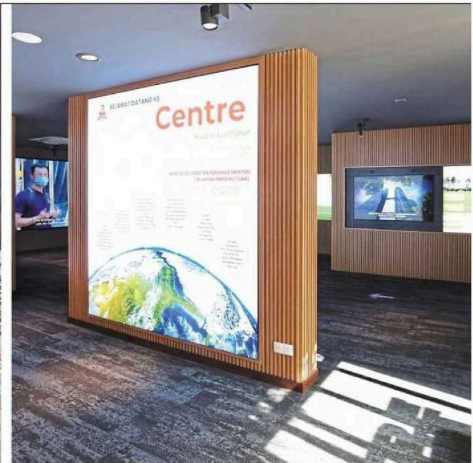
The centre at Plaza The Exchange TRX will share knowledge and disseminate information on the authorities' ESG framework.