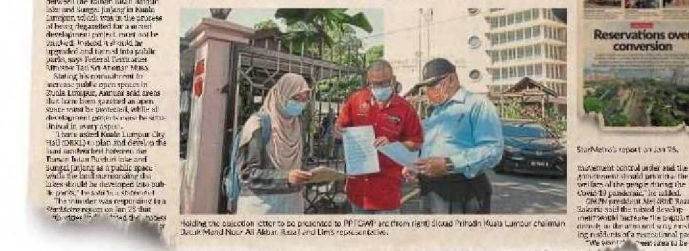
StarMetro article on Jan 27, 2021.

Turn plot near Taman Intan Baiduri lake earmarked for development into public parks, DBKL told