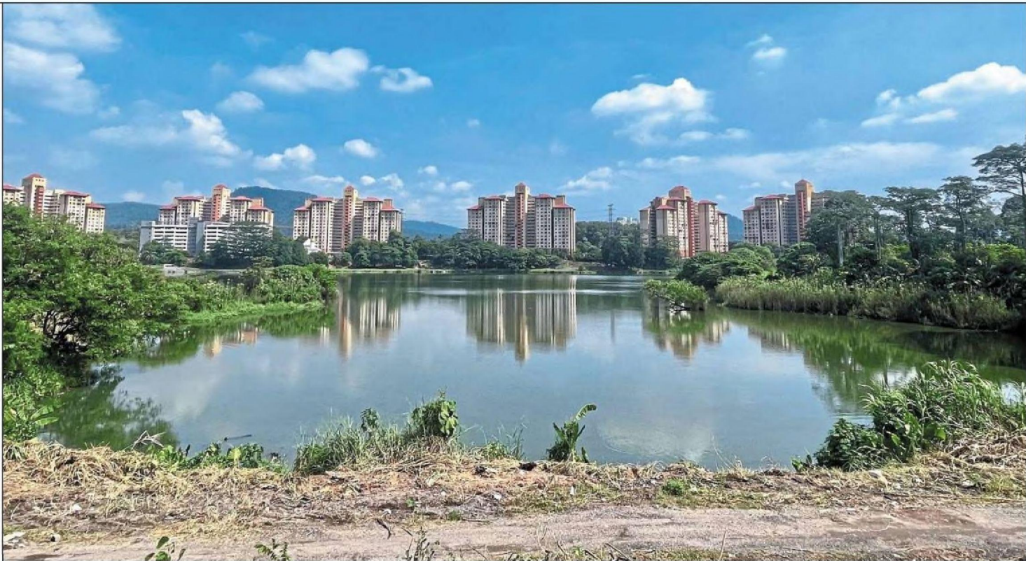
Residents living around Taman Tasik Intan Baiduri in Kepong worry losing this natural oasis.