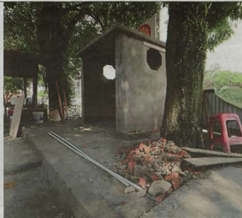
DBKL enforcement officers demolishing the illegal structure on Thursday evening. (Right) Construction of the illegal prayer stall, located near a petrol station and TNB substation, had carried on despite public complaints.