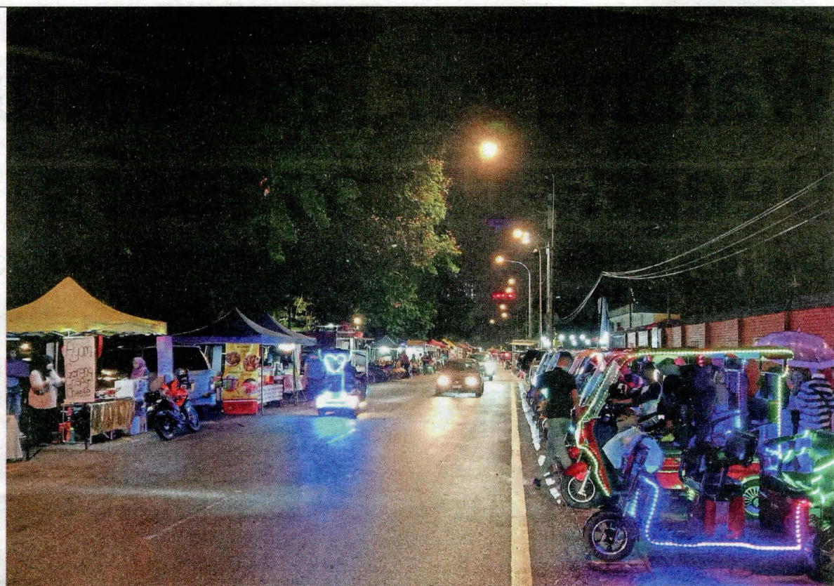
Escooters modified into 'tuktuks' are being rented out to visitors outside Taman Tasik Titiwangsa. (Bottom) Inconsiderate motorists who block the gates of residential properties, have prompted the operators of a welfare home to put up a "no parking" sign.

They are only permitted in gazetted places such as playgrounds and shopping centres.