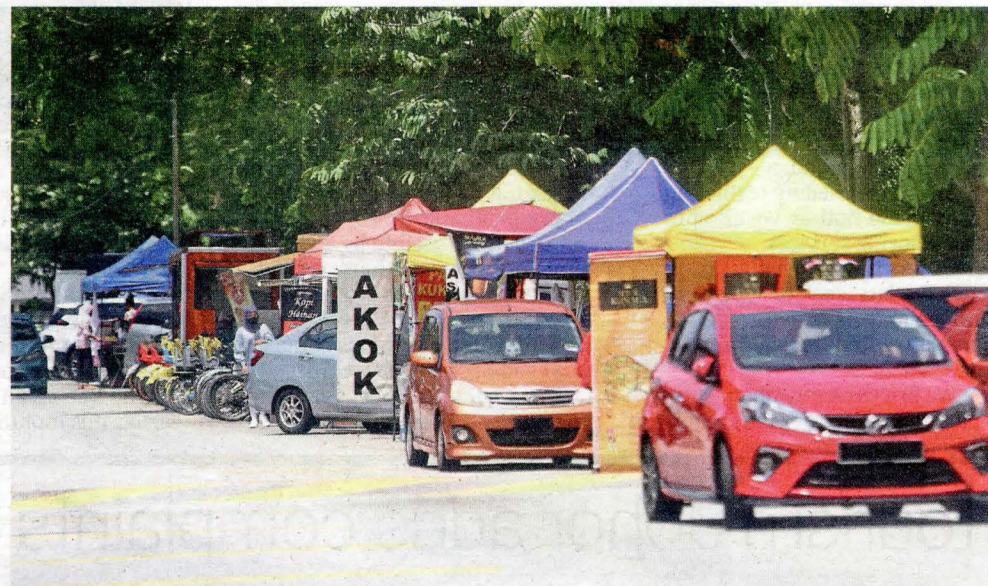
Traders taking up parking bays along Jalan Kuantan meant for visitors to Taman Tasik Titiwangsa. (Right) The many stalls lining the road, offering products and services.