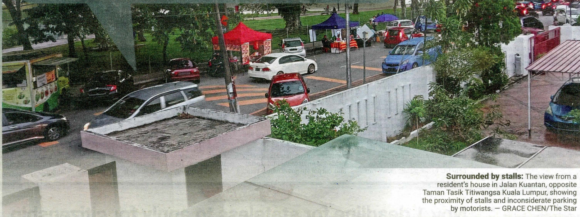
Surrounded by stalls: The view from a resident's house in Jalan Kuantan, opposite Taman Tasik Titiwangsa Kuala Lumpur, showing the proximity of stalls and inconsiderate parking by motorists.

Residents near Taman Tasik Titiwangsa in Kuala Lumpur are fed up with the activities of traders operating illegally as well as inconsiderate motorists while the apparent lack of action by the authorities adds to their frustrations.