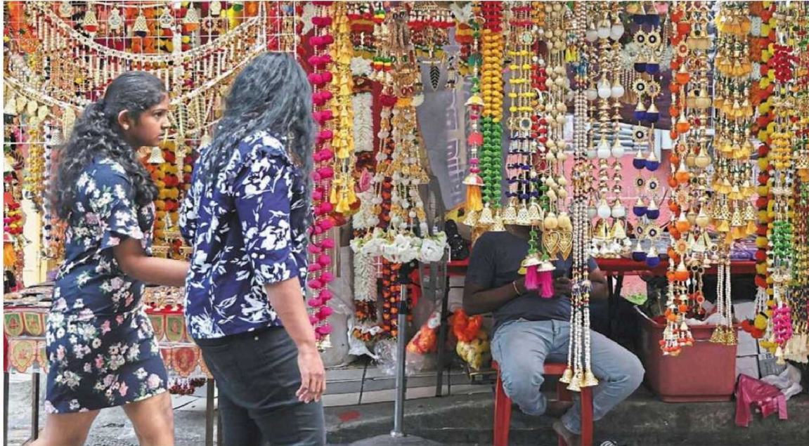
Visitors to the bazaars will find colourful traditional clothing, costume jewellery, various types of Indian sweets and biscuits as well as decorative items.

Dan Penjaja Kecil Interaksi Kuala Lumpur dan Selangor, organiser of this year’s Deepavali bazaar in Jalan Masjid India, anticipates business to increase closer to the festival.