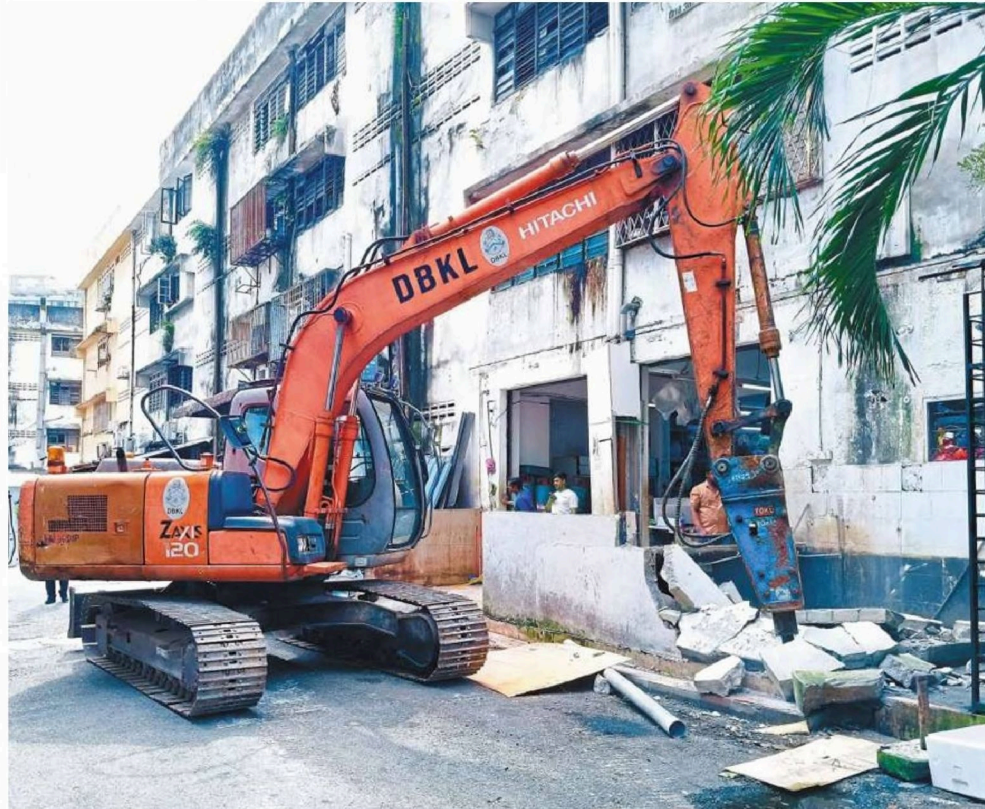
A DBKL excavator demolishing an illegal extension at Jalan Angsoka in touristic Bukit Bintang.