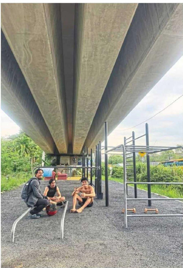
Open Bars is an outdoor gym below a link bridge at Jalan Kampung Pasir in Kuala Lumpur.