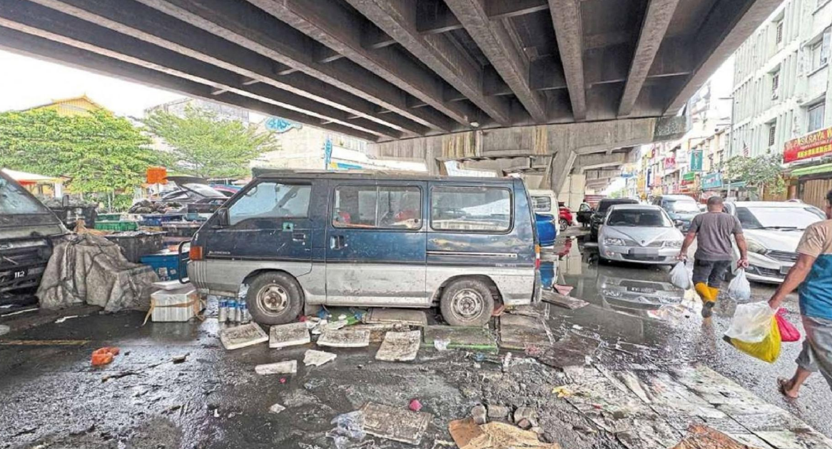
The carpark under Jalan Yew-Jalan Sungai Besi flyover has become a site for rubbish and abandoned cars.

Lumpur Local Draft Plan 2040 (PTKL2040) to allow placemaking under flyovers was subject to land-use zoning.