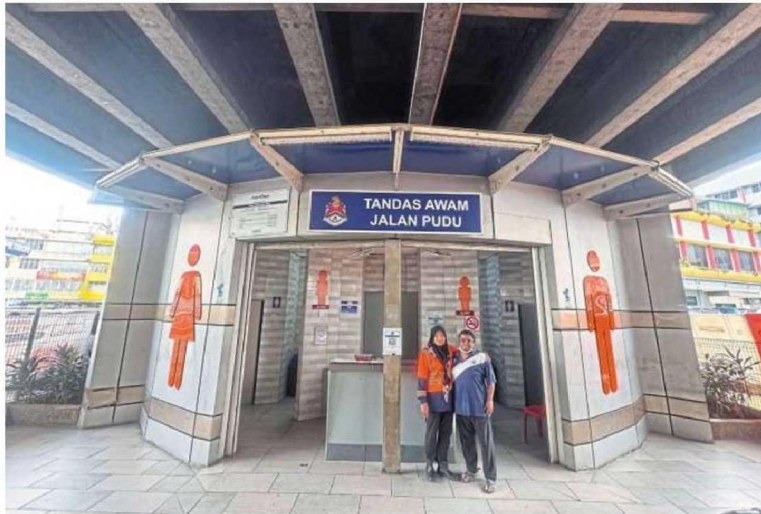
A public toilet under the Jalan Yew-Jalan Sungai Besi flyover.

Communications Minister Fahmi Fadzil, who is also