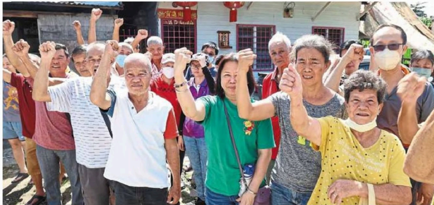
Squatters from Lot 53696 in Taman Jinjang Baru want authorities to meet them to resolve their housing issue.

At press time, DBKL had not responded to requests for comment.