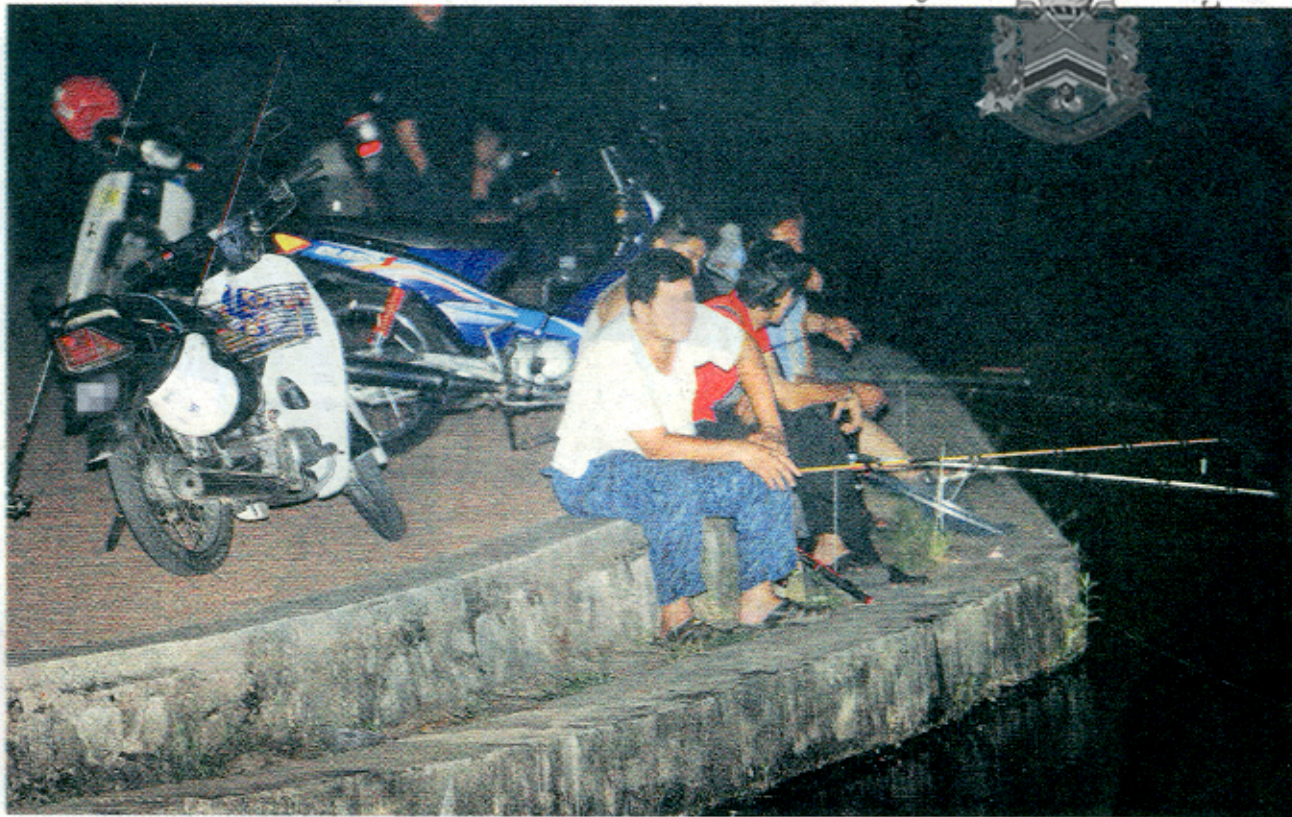
Anglers bring their motorcycles into the park although the rules prohibit it.

"My daughter was traumatised by the incident and vowed never to come back to the park