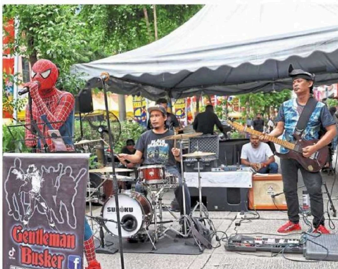
Street buskers providing entertainment as people shop for food and festive items in Lorong TAR.