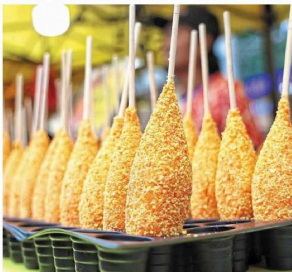
Cones of golden breadcrumbs at Noraini's Korean corndogs stall.