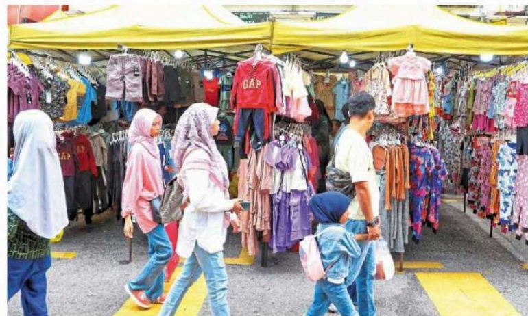
Those looking for Raya clothes are also well-served in Lorong TAR.