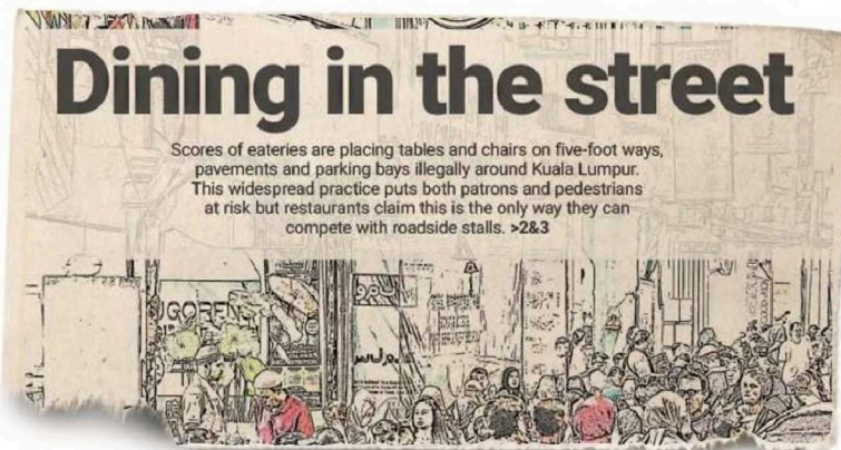
StarMetro report on April 7.

Section 46 of Street, Drainage and Building Act 1974 for obstruction in both Jalan Sultan and Jalan Petaling.